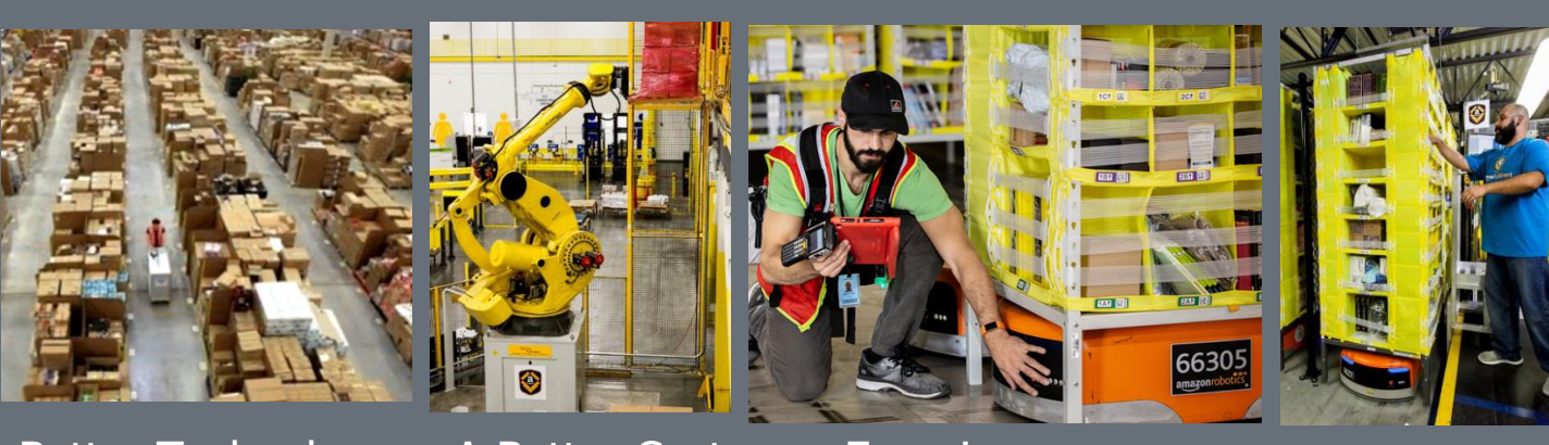
Better Technology = A Better Customer Experience