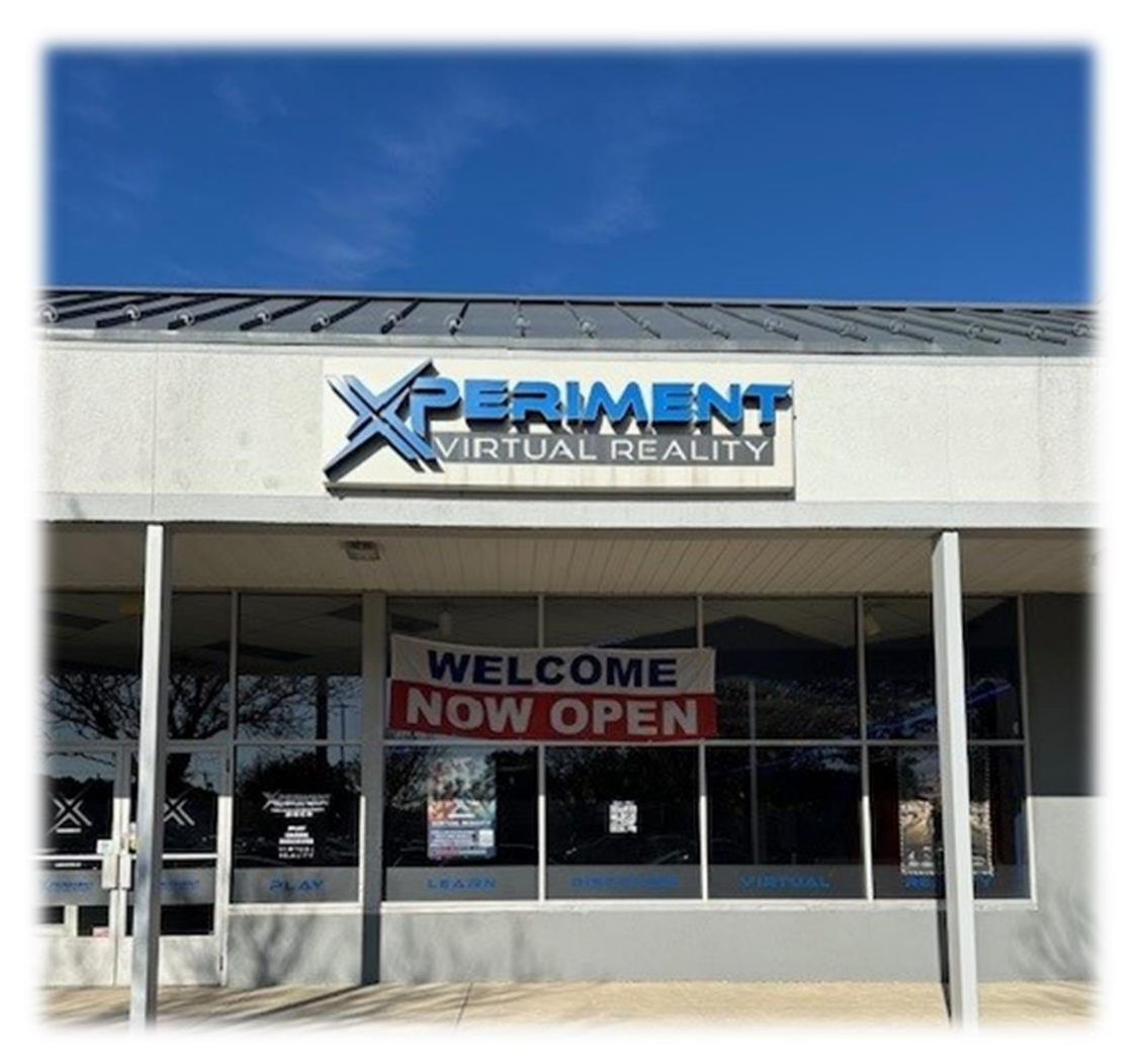
Xperiment Virtual Reality