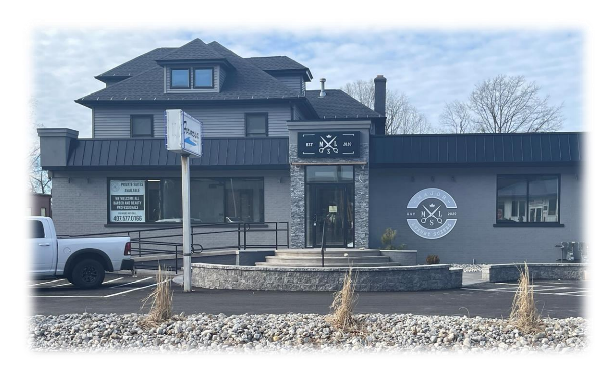
Former Formosa Restaurant 132 Middletown Avenue