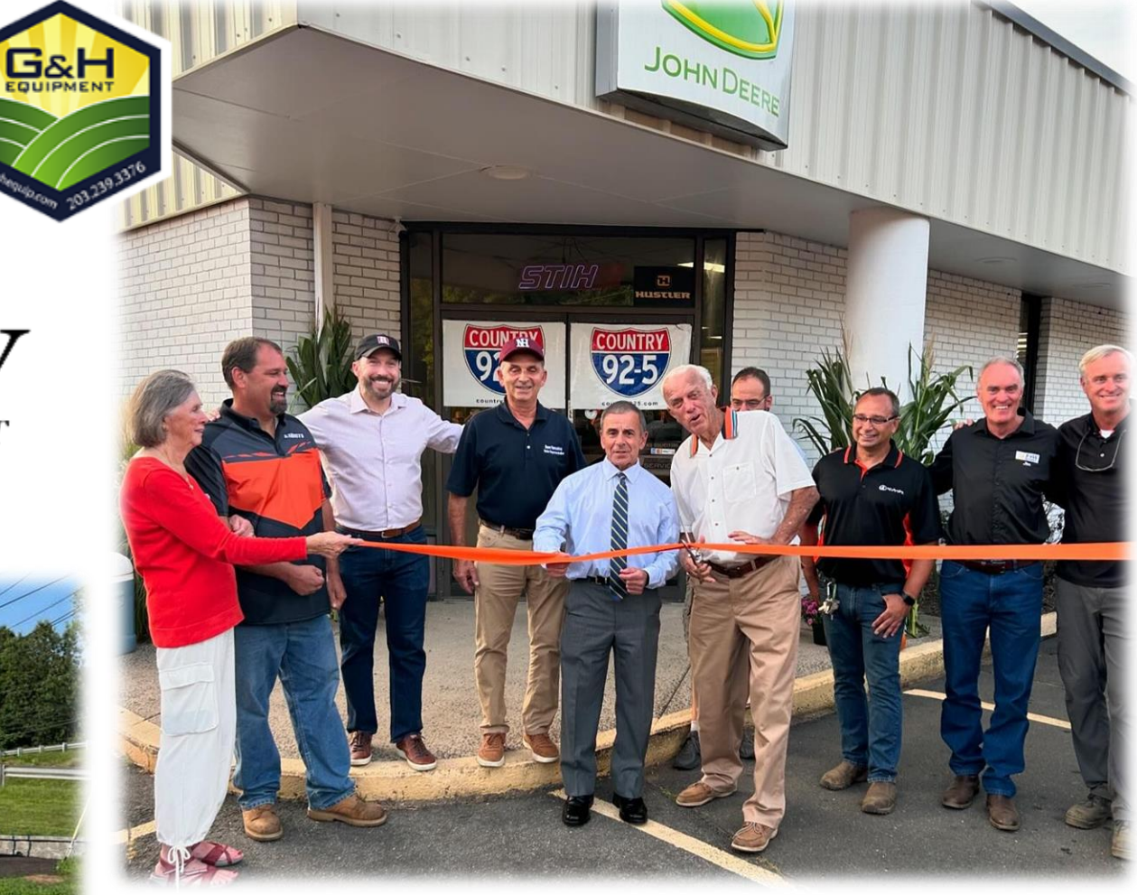
F&W Equipment 314 Old Maple Avenue