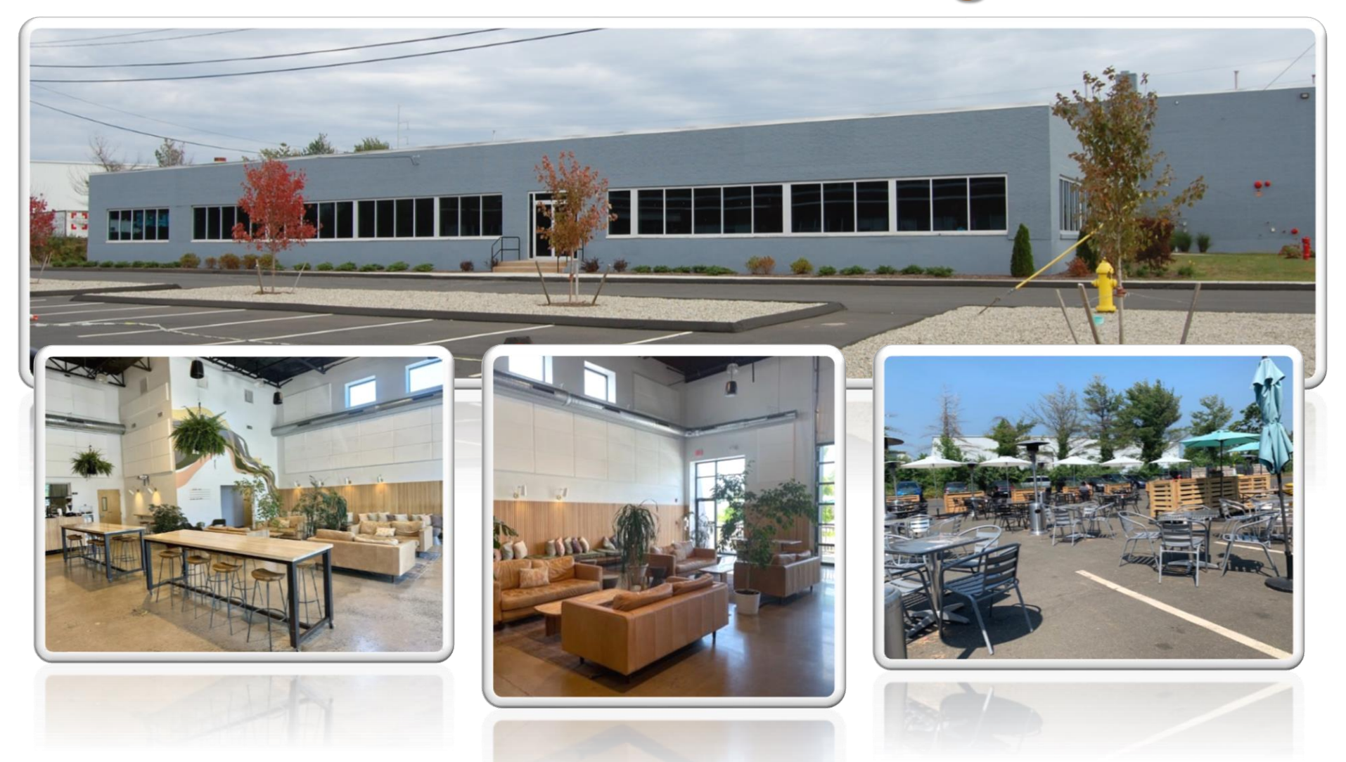
341 State Street