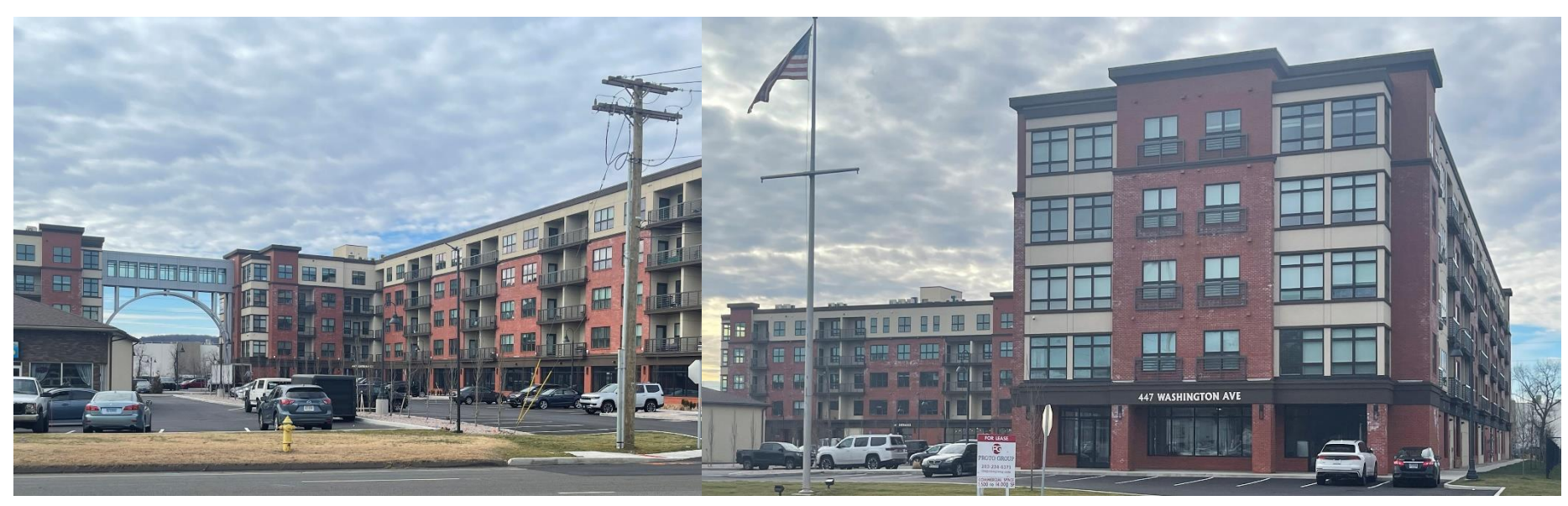
445 – 447 WASHINGTON AVENUE