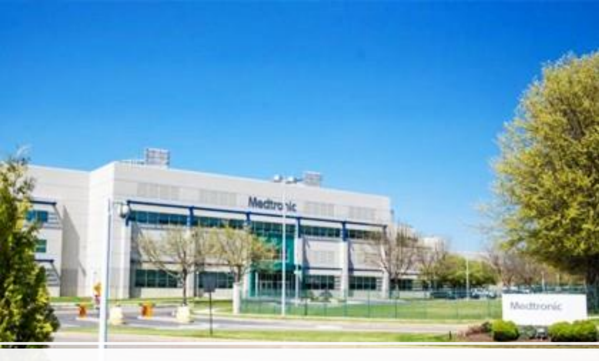
MEDTRONICS EXPANSION $1 Billion OVER NEXT 5 YEARS